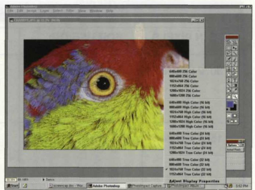
Sample of screen capture image brought into our lab for output from inkjet to poster.