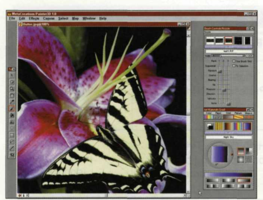
Sample of screen capture image brought into our lab for output from inkjet to poster.